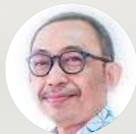
Ignatius Warsito MOI Indonesian Government