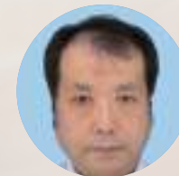
WATANABE Nobuhiro NISC Japanese Government